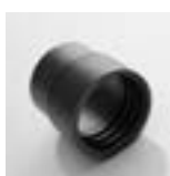
Cuff for Master-VAC