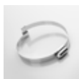
Master-Grip Hose Clamp, screwable

All data refers to an ambient temperature of +20 °C Manufactured to order, lead time approx' 7 days. Available on request in other lengths and sizes. Subject to technical changes and colour deviations.