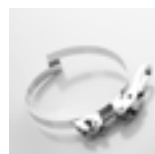
Master-Grip Quick-Fix Clamp